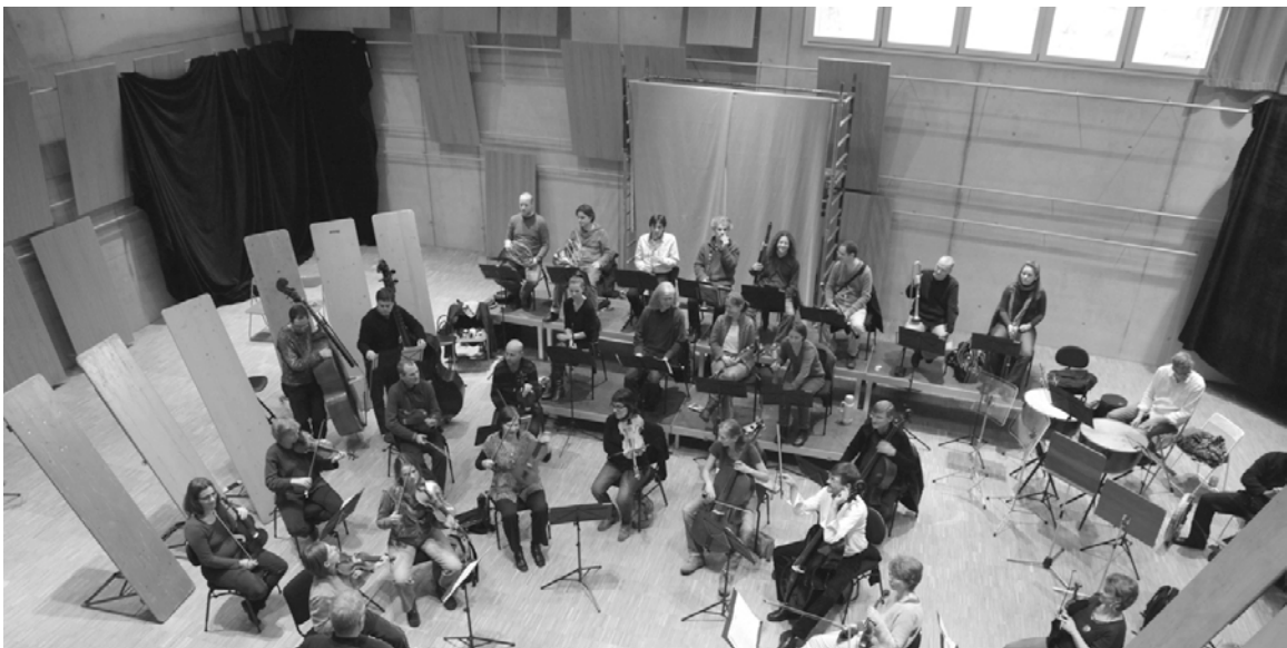
Final setting of the rehearsal room during acoustic test with the Freiburger Barockorchester. Risers were preferred for woodwinds and brass even in the rehearsal condition. Note the vertically inclined beer-garden tables close to the strings and note the absorption behind the orchestra. No absorption was acceptable in front of the orchestra.