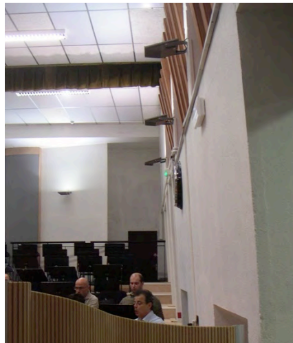
Vertically inclined side wall, leaning forward, choir rehearsal room Toulouse.

The Théâtre du Capitole (opera) in Toulouse had to move out of their choir rehearsal room, and a derelict cinema was transformed into a choir rehearsal room. During the first rehearsals, reactions of the singers were extremely negative and Kahle Acoustics was called in for a study and improvement proposals. While the room is clearly on the small side for a rehearsal room for a professional choir, first inspection and measurements, as well as first listening impressions from a window on the first floor looking into the upper part of the volume of the room, showed no immediate problems or insurmountable difficulties. It was only when testing the room after the choir had left that the main problem was identified: the lower side walls of the shoe-box shaped room are vertically inclined, “leaning forward” with an angle of about 5°, leading to a significant amplification of the sound level in the lower part of the room and a “bathroom effect”. The inclination of the walls “holds” the energy in the lower part of the room and the sound of the upper volume is entirely masked for singers in the lower part of the room. Placing acoustic absorption in front of the side walls (about 50% of the surface of the lower walls) improved the situation but was still not sufficient to suppress all negative effects of the tilted side walls.