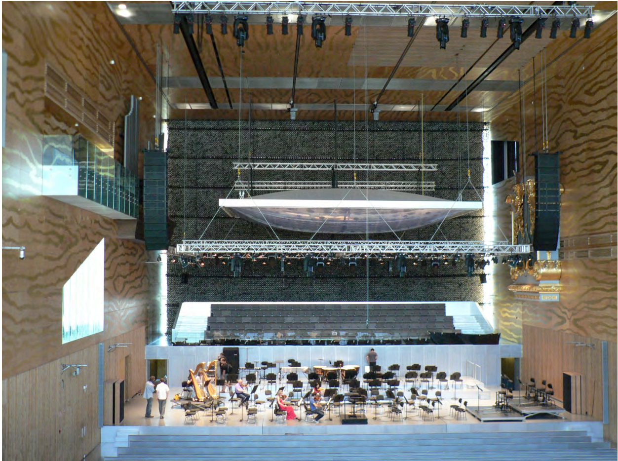
Concert Hall at Casa da Musicá Porto, configuration as found at the beginning of the acoustic tests.

The Concert Hall at Casa da Musicá in Porto has always had good acoustics, especially for medium-sized ensembles, but it turned out that the hall's Symphony Orchestra had in fact never been fully happy with the room's acoustics. Musicians complained about difficulties of hearing on stage, the sound in the hall was somewhat frontal and often compressed during big orchestral tuttis and serious balance problems were observed. Kahle Acoustics was asked to evaluate the acoustical quality of the room and to make remedial proposals – even changing the room, if required. The following image shows a photo of the room as set when we arrived, prior to any changes.