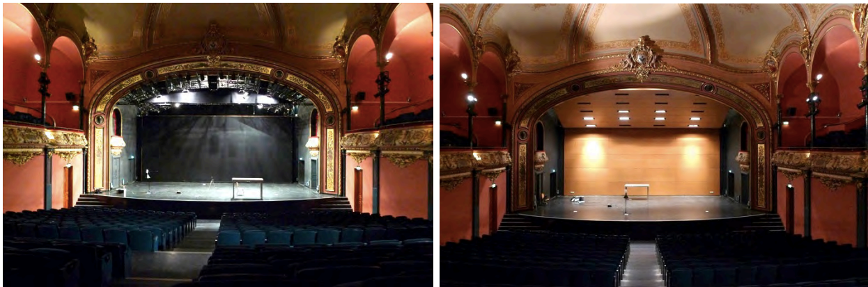
Salle Poirel, Nancy: without orchestra shell (left photo), the black rear wall is acoustically absorbing, and with orchestra shell (right photo). The orchestra preferred to play in the configuration without orchestra shell as the tight shell created more negative than positive effects before absorption was added.

The Nancy Symphony Orchestra is playing in the Salle Poirel , a moderately-sized hall from the late 19 th Century. The hall, seating about 900, has a small stage house, and as part of a renovation in 1999 a quite closed, wooden orchestra shell was added. Astonishingly for most acousticians, the reactions from the musicians and even more from audience members and experienced listeners were very negative and the orchestra stopped using the concert shell after a few concerts. The main complaint was not that the reverberation time with the concert shell was too long (reverberation time with shell was still below 2 seconds) and that loudness levels on stage were sometimes excessive, but that the sound from the shell was muddy, compressed, lacking clarity and creating localization problems – all of the sound, both early sound and reverberation, was coming from the same location, from the stage.