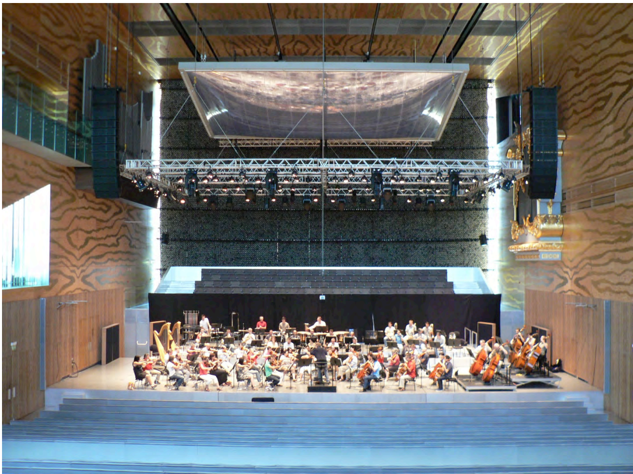
Concert Hall Casa da Música during the acoustic tests: rear wall absorption, raised and tilted canopy.

Musicians instantly reacted positively to absorption being placed behind the brass and percussion instruments, stating that loudness levels are reduced and that hearing of string players was significantly improved. In the beginning, no curtains were placed behind the tympani at the center of the stage, as the balance with the tympani was found to be good. We were approached by a flute player who noted that the sound on stage was still somewhat confused; he invited us on stage next to him – where his observation could very rapidly be confirmed. Once again the situation was significantly improved when placing a curtain behind the center of the stage, basically covering 100% of the rear wall of the stage with absorption, between the stage and choir balcony. The absorption has in the meantime been placed behind the acoustically transparent, perforated metal cladding, and some absorption was even integrated into the side walls of the stage next to the brass and percussion players in an invisible manner.