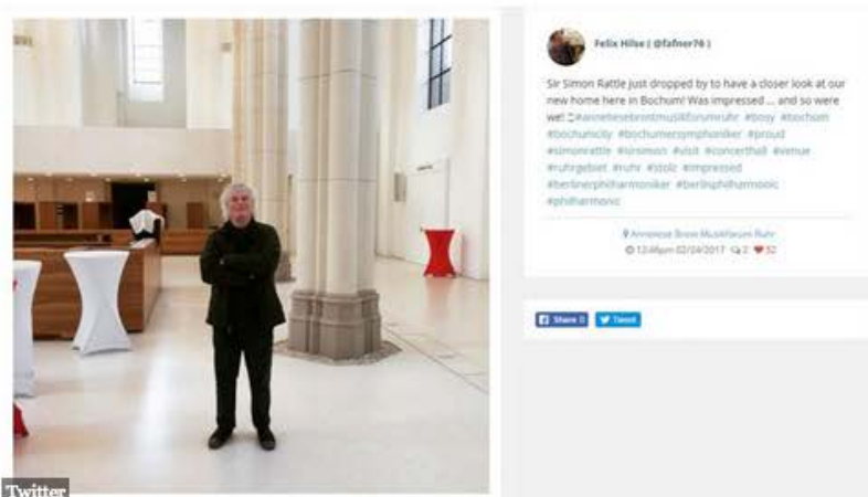
Simon Rattle checked out the Bochum Hall even before it opened.

similar if not worse situation than Munich, at six times Munich's size – isn't so far but looking for a solution, but desperately needs one to add a good concert hall to the present selection of eyesore-misfits (Barbican), ho-humishness (Southbank) or high-school-auditorium-flair outdatedness (Cadogan). All these cities are cultural metropolises with world class orchestras; all found it or are finding it difficult to properly serve their cultural gems with adequate venues and balance the public interest and public financing in a politically expedient way.